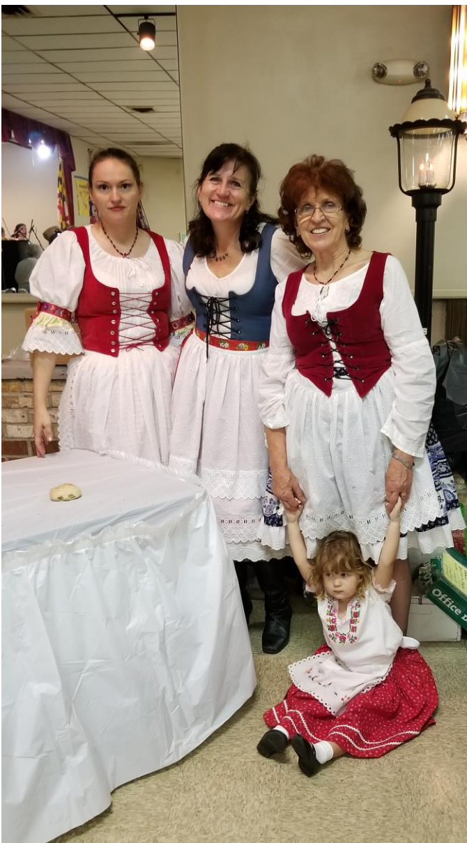
31st Annual Czech and Slovak Festival

A publication of the Czech and Slovak Heritage Association of Maryland