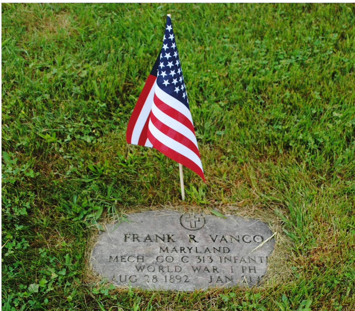
Memorial Day in Baltimore

A publication of the Czech and Slovak Heritage Association of Maryland