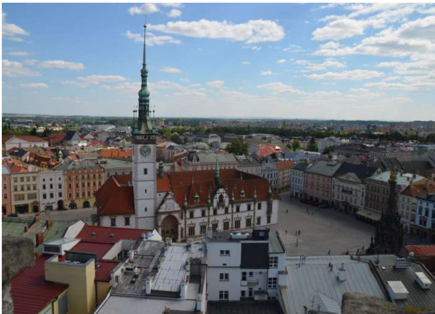
Olomouc – UNESCO beauty - Upper square with City Hall

A publication of the Czech and Slovak Heritage Association of Maryland