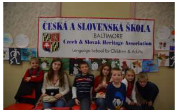
Czech and Slovak School for kids