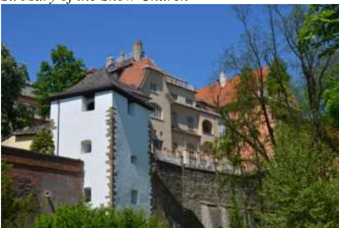
City walls and gardens