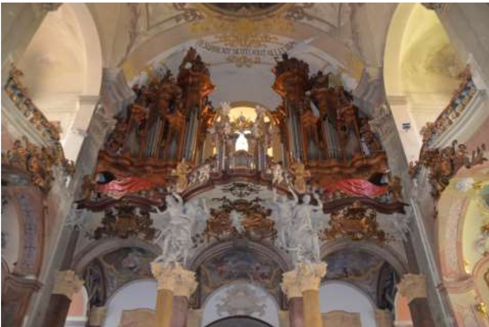
St. Mary of the Snow Church