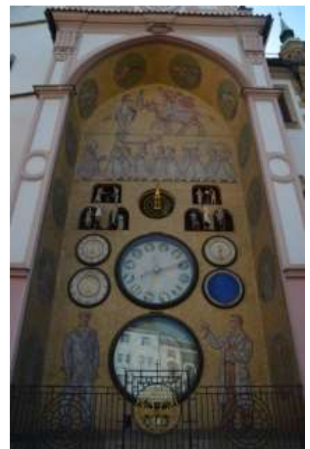
City Hall and its astrological clock