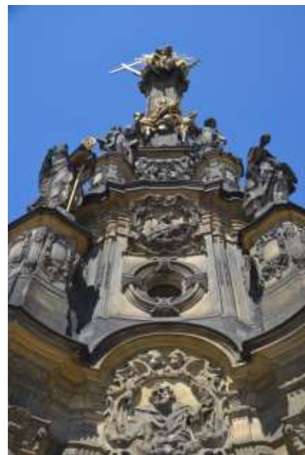
Holy Trinity Column – Main Square – Sloup Nejsvětější Trojice