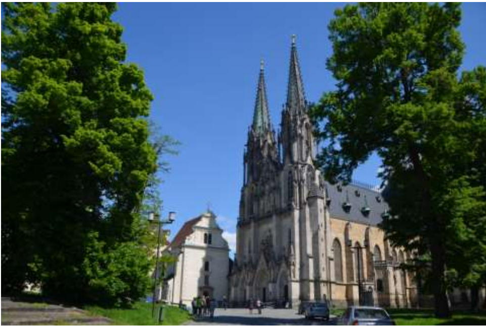
St. Wenceslas Church