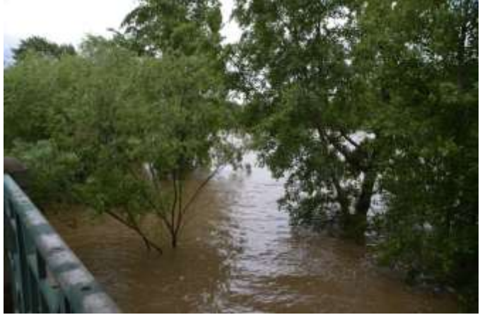
Prague embankment -popular walking path flooded