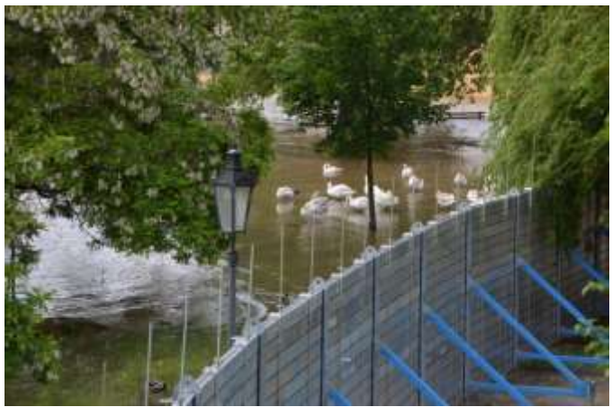
Malá Strana – Flood barriers and swans Vltava a labutě okupují Malou Stranu