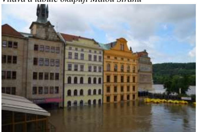
View from Charles Bridge