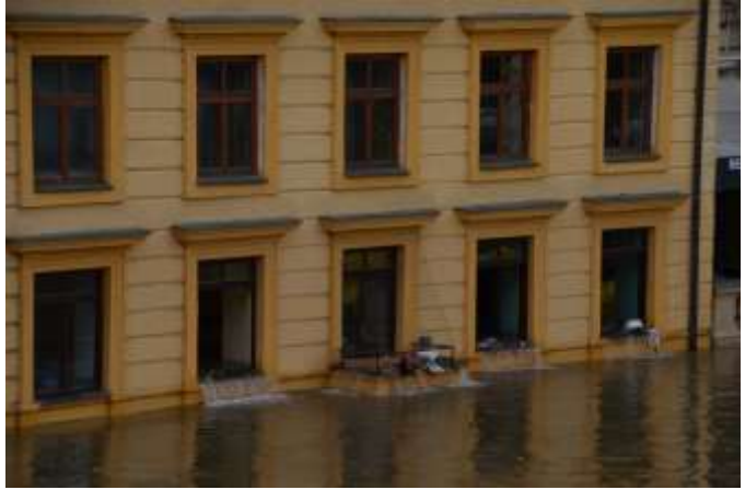
Novotného Lávka – flooded bars and music clubs