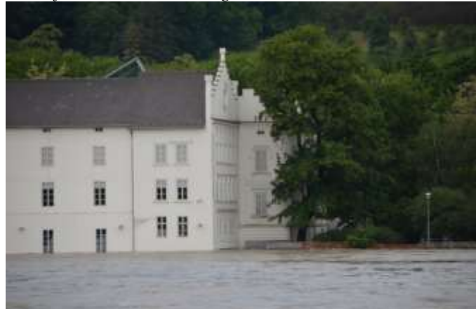
Kampa – flooded Sovovy mlýny – a museum