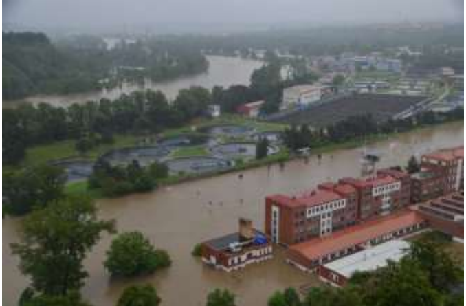
Flooded Prague 6, Zoo in the background