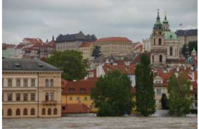
Kampa resisting thanks to flood protection