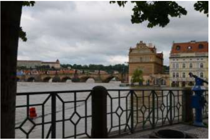
Novotného lávka - flooded