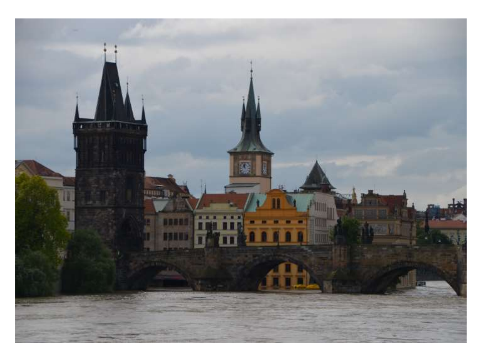
Flooded City of Prague in early June 2013

A publication of the Czech and Slovak Heritage Association of Maryland