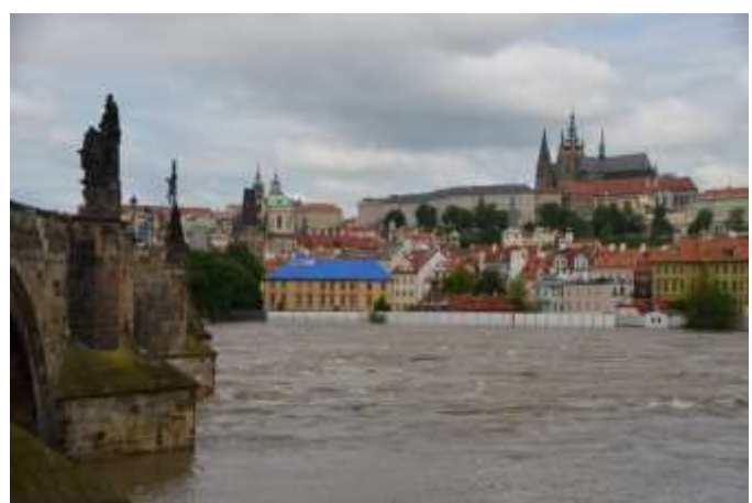
Prague Castle safe, Kampa in danger Kampa zastavěna povodnovými bariérami

In early June Prague braced for another huge flood in just over a decade. It's been 11 years since the horrible floods of 2002 that flooded the historic part of Prague - Kampa, Karlín, Prague's Metro system and many parts of Prague including the ZOO that was not able to evacuate all the animals on time. This year, the water brought damage as well, Prague suburbs on the river were flooded; part of the ZOO was under water again, but all the animals were transported to safety in time. The Metro was not damaged. The situation was much worse in many places throughout the country, not a single county in Bohemia was spared.