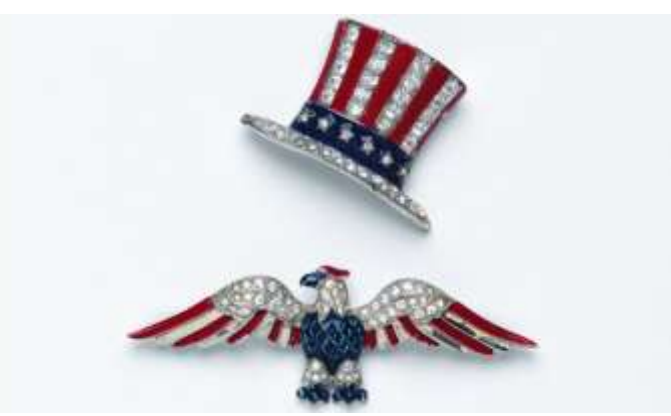
Uncle Sam hat and American eagle pin convey pride in the USA

additional way of expressing what I was saying, a visual way to deliver a message." That snake pin is seen on the cover of her book and in the announcement of the exhibit in Cedar Rapids.