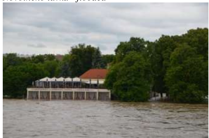
Střelecký Ostrov near National Theater