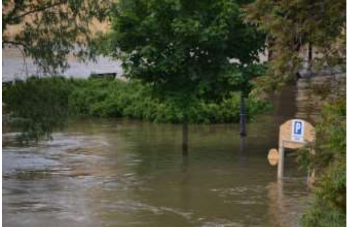
At Kampa - flooded