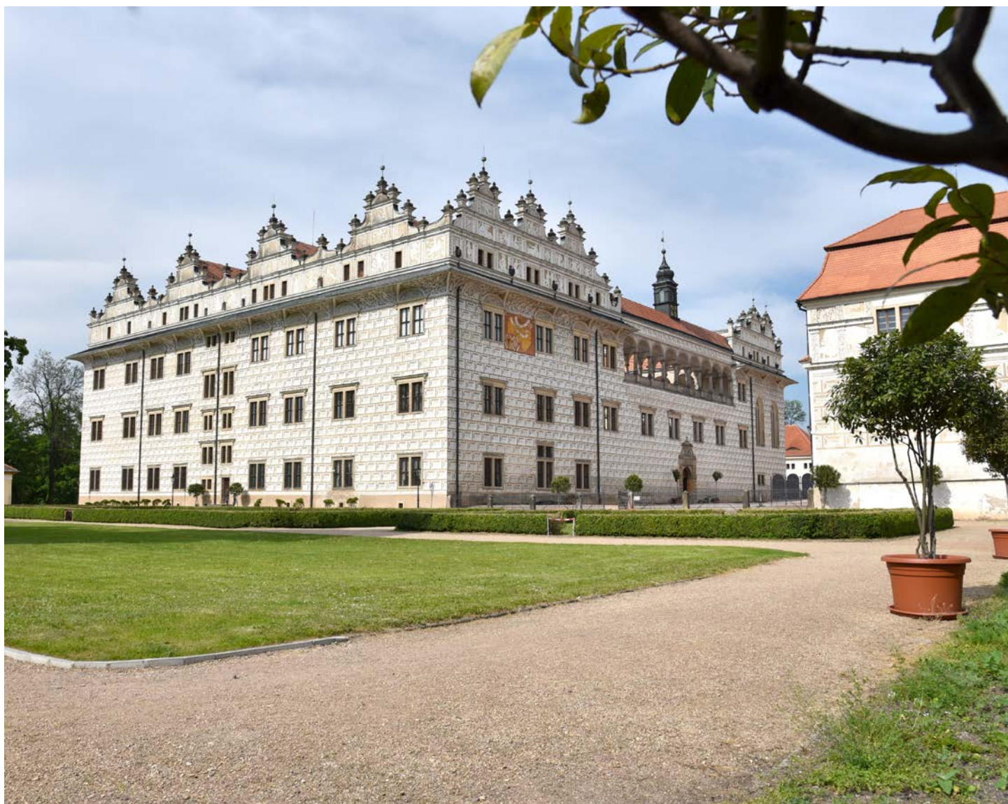
Litomyšl – one of the UNESCO heritage sites in the Czech Republic

A publication of the Czech and Slovak Heritage Association of Maryland