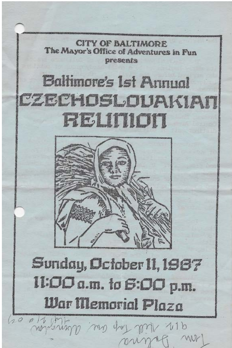
Program from 1987, first Czechoslovakian Festival