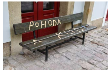
.....on these fun benches