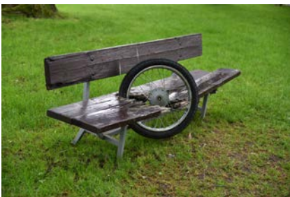
Come visit and rest .....