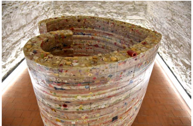
The Heart for Václav Havel