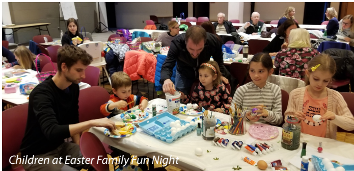
Children at Easter Family Fun Night

April 5, 19 Kraslice: Budeme učit deti, jak malovat vajčka. Vezmeme pár sušicí plátů a předstokmím a školským věku a uděláme jim "demo" a "presentation". Jak nato: Potřebujeme: 1) Děti 2) Vajčka, přednostně vařená na tvrdě 3) Barvy - v jakékoliv podobě, ale hlavně základní, jak máme, červená, modrá, žlutá. 4) Jídlo pro dospělé, aby se nenudili. Pivo ne, je to v kostele. Tak to všechno zamícháme a co z toho vyjde: 1) Děti si nepřijí "demo" ani "presentation" v jakékoliv podobě. 2) Děti mají i jen jeden modus-creativity. 3) Děti jsou abstraktní umělci. Jak se to vše projevuje: 1) Děti se zapatlají. Vědí, že když malují má být overall zapatlání od barev. 2) Děti zapatlají vajčka jako by to bylo malířské plátno. Hlavně je baví. Jedna holčička šla na to profesionálně: udělala si napřed modrou kasičku a zamíchala to kousem eukalyptu. Jeden chlapec napřed začal dělat do vajčka díry, na tvrdě vařeně, tak to my drží, tak to bude výtvarník. 3) Děti vyrobily malovaná vajčka jedno krásnější než druhé. Kartičky na jedno máma lování podle individuálních uměleckých představ. Žádné kopírování. 4) Gratulace rodičům - co z nich vykoučíte to z nich budete mít. Žádný poched za naporem.