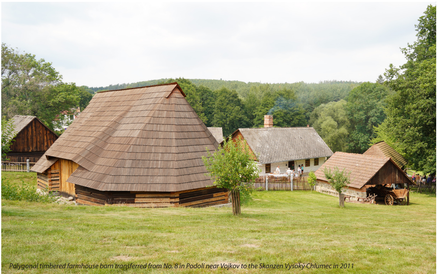
Polygonal timbered farmhouse barn transferred from No. 8 in Podolí near Vojkov to the Skanzen Vysoký Chlumec in 2011