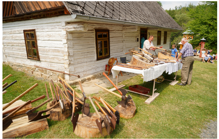
up - tools for show and sale down - newly unveiled bell tower

So if you're going to be in the Czech Republic next summer, definitely think about heading down to Vysoký Chlumec to take in the 2020 Skanzen event.