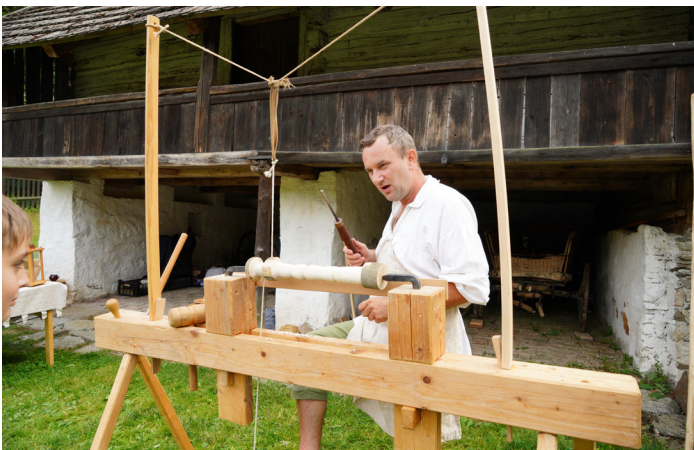
Old fashioned way of carving table and chair legs or bowls and plates