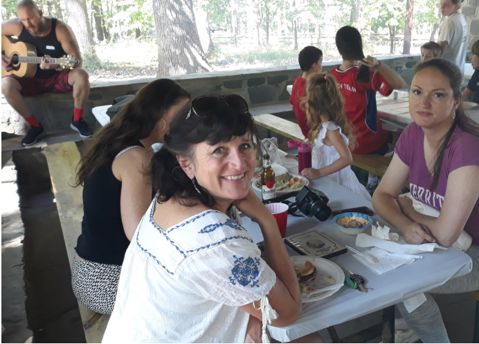
Members and friends of CSHA at Patapsco State Park picnic location